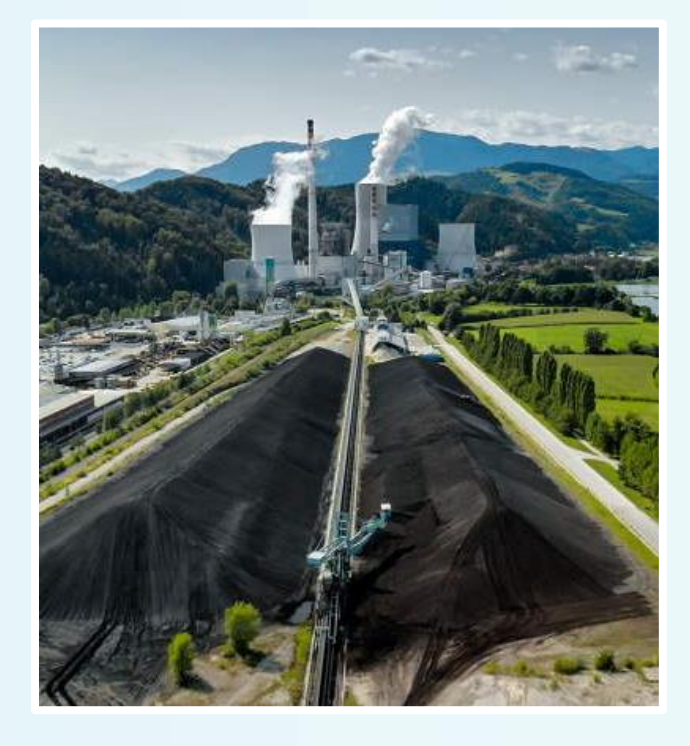
EUR 258 million, multi-fund programme, 2 plans (SAŠA and Zasavje regions)